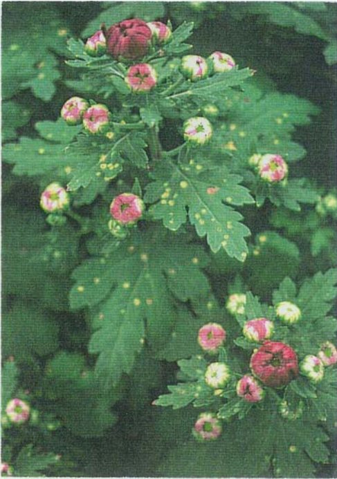
Older lesions on upper leaf surfaces