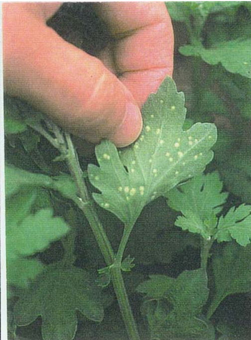
Pustules on lower leaf surface

White rust can spread rapidly in a greenhouse or nursery, resulting in severe losses.