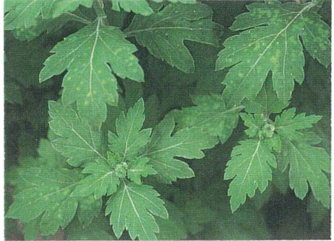
Yellowish blotches on upper leaf surfaces