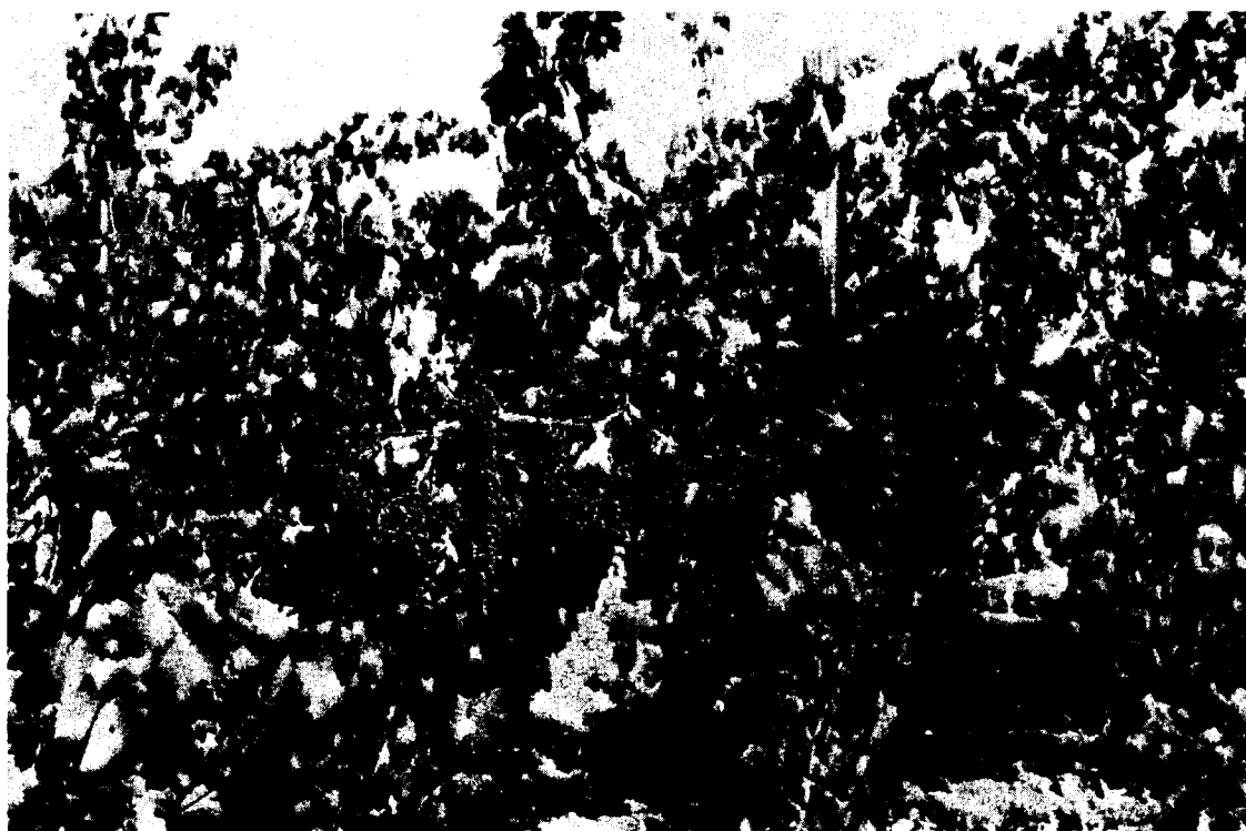
Cabernet Sauvignon-- Leading wine grape variety in Napa County in acreage, production and value.