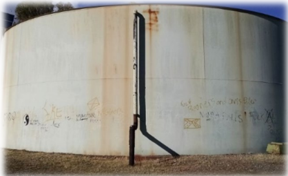
Water Storage Tank