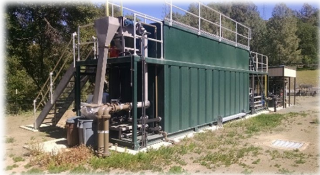
MBR Treatment Unit