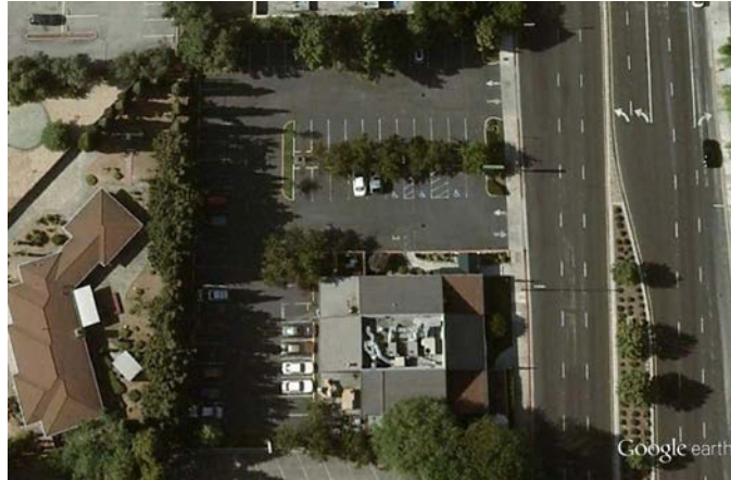
Figure 2. Existing Site Conditions.

Constraints include impermeable soils (hydrologic soil group D), very high intensity land use, and flat slopes. Disposal of runoff to deep infiltration is not feasible on this site due to the low permeability of the clay soils. High land values, the objective of creating a dense retail area, and parking requirements limit opportunities to reduce site imperviousness.